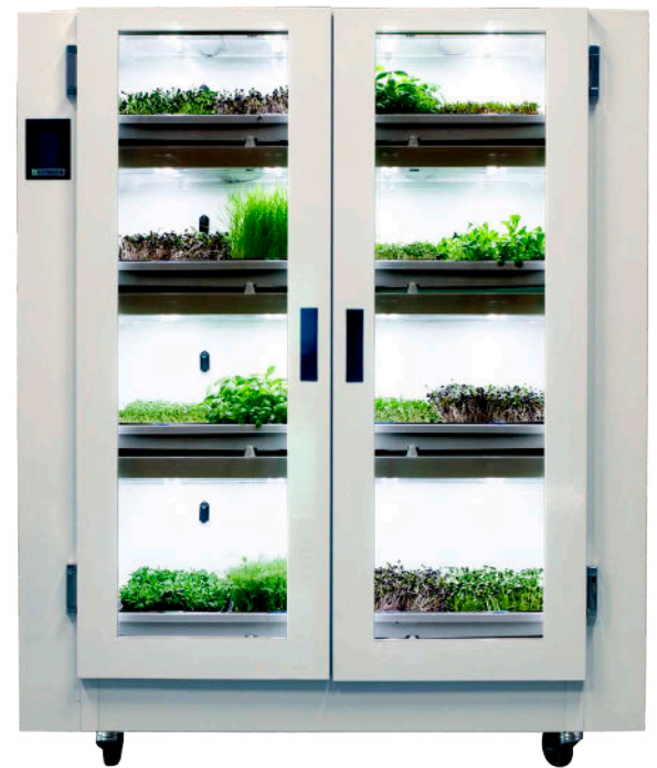
*Residential model shown with optional cutting board top